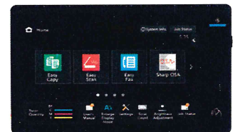
10.1" (diagonally measured) customizable touchscreen display.