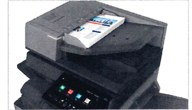
High capacity 300-sheet DSPF scans documents at up to 280 images per minute.